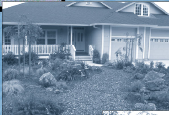
Lawn sheet mulched in place

A conventional landscape is transitioned to a Bay-Friendly landscape.