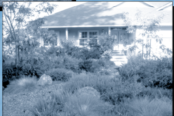
One year later