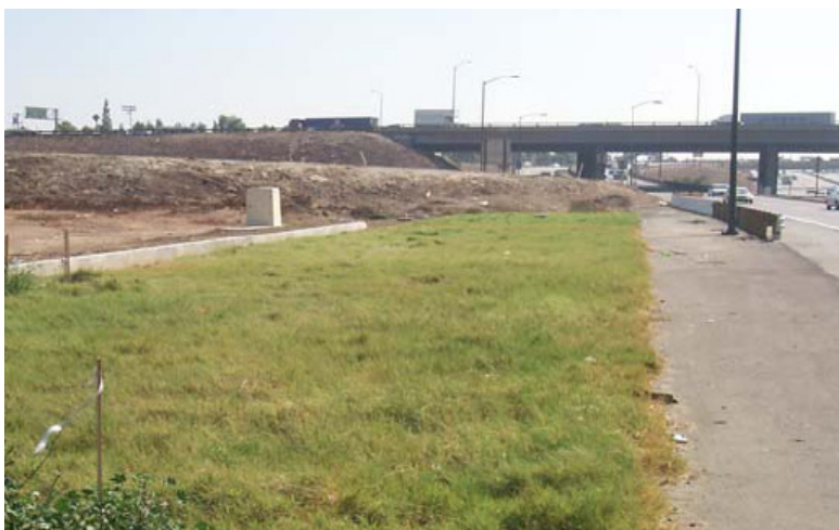
Figure 6-18: Roadside Vegetated Buffer Strip