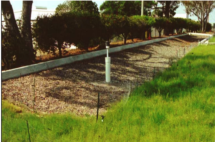
Figure 6-21. Infiltration Trench.