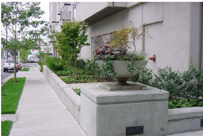
Figure 8-2: Flow through planter