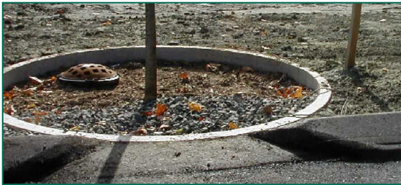
Figure 8-3: Non-proprietary tree well filter