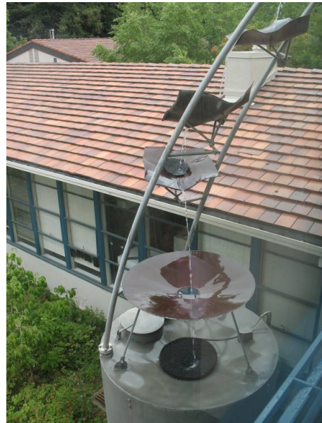
Figure 8-7: Rainwater harvesting system, Mills College, Oakland