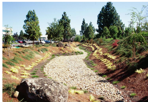
Figure 8-6: Extended Detention Basin, Palo Alto