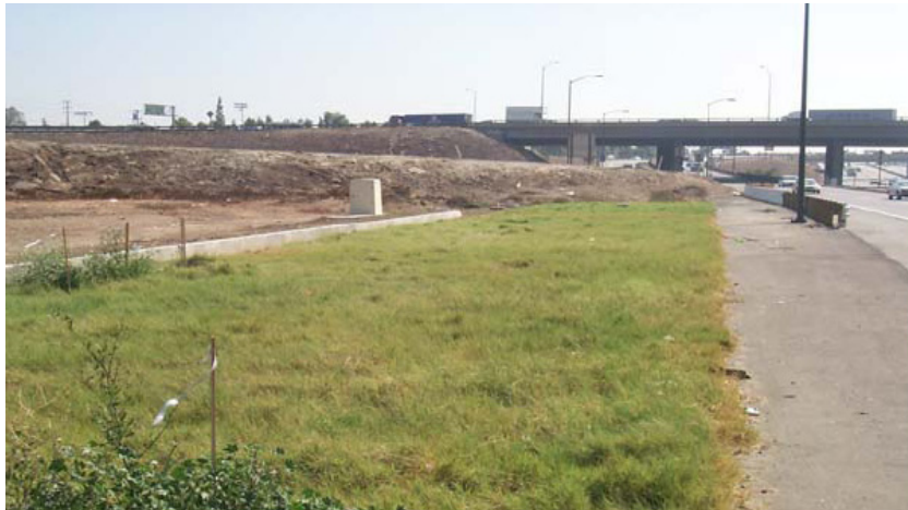
Figure 8-4: Vegetated Buffer Strip