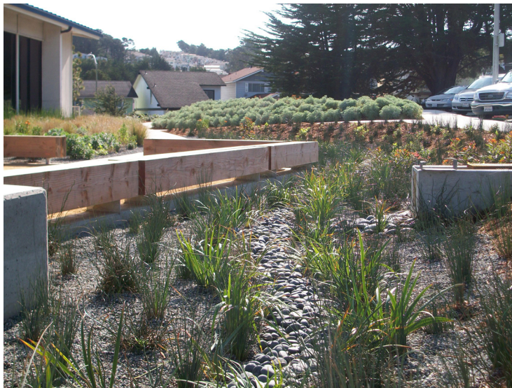
Figure 8-1: Bioretention Area in Daly City

Inspect and, if needed, replace mulch before the wet season begins. Mulch should be replaced when erosion is evident or when the bioretention area begins to look unattractive. The entire area may need mulch replacement every two to three years, although spot mulching may be sufficient when there are random void areas.