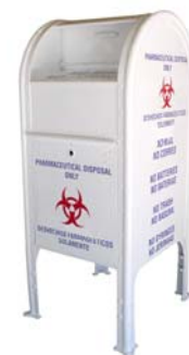
Pharmaceutical Drop-off container