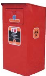
Sharps disposal container

If your health care provider does not offer collection, find a disposal bin at the following locations: