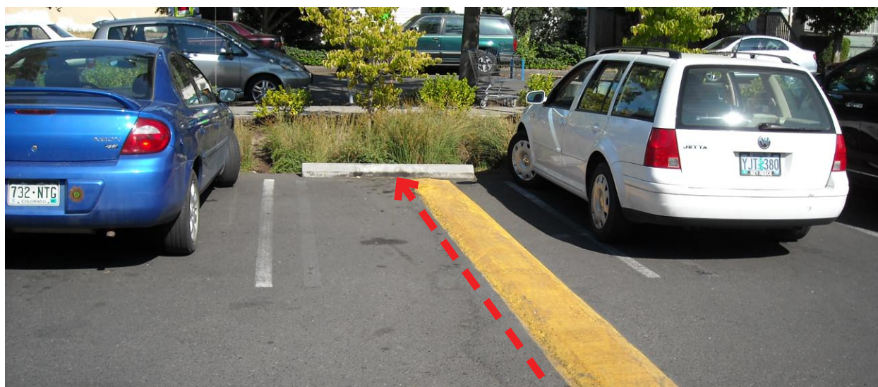
Figure 5-38: A concrete unit paver is placed at the exit point of this trench drain. The pad helps prevent erosion by dissipating water velocity as water drops from the trench drain to the finish grade of the stormwater facility.