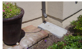
Runoff is directed to landscaping.

These requirements are in the San Francisco Bay Region Municipal Regional Stormwater Permit (MRP) 1 and are described below.