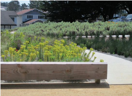
Native plants provide habitat for birds, bees, and butterflies.