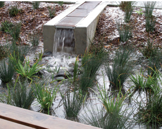
Channels bring water from the parking lot into the stormwater gardens.