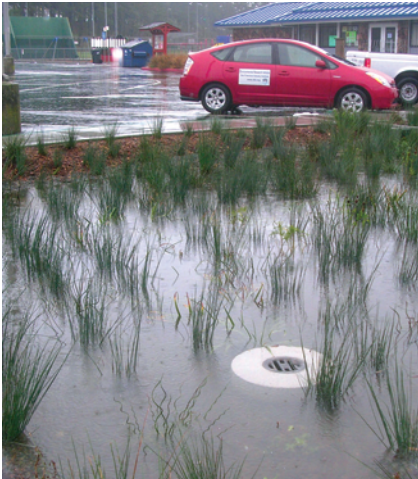
The stormwater gardens help slow, spread, and sink heavy flows.

The stormwater gardens have been highly successful at removing pollutants in stormwater runoff, pollutants that would have otherwise flowed into Colma Creek and ultimately San Francisco Bay. The San Francisco Estuary Institute collected water quality samples before and after the stormwater gardens were built, and found that the gardens reduced pollutants as follows: