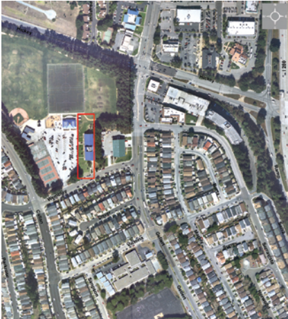
Project location off of I-280 (far right).

The gardens total 4,600 square feet, accounting for over 3 percent of the entire drainage area. They are planted with native plants, including rushes, sedges, and native grasses, as well as flowering species like monkeyflower, lupine, and ceanothus (wild lilac), among others.