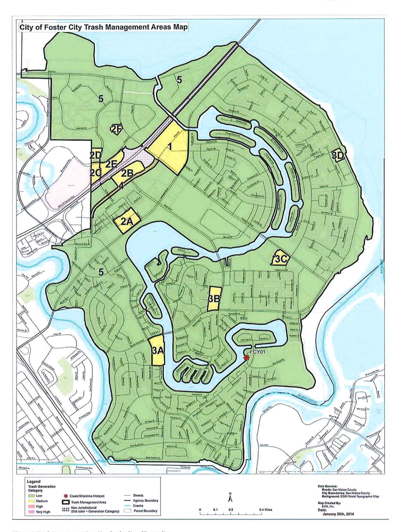
\textbf{Figure 6.} \ \textbf{Trash Management Area Map for the City of Foster City.}