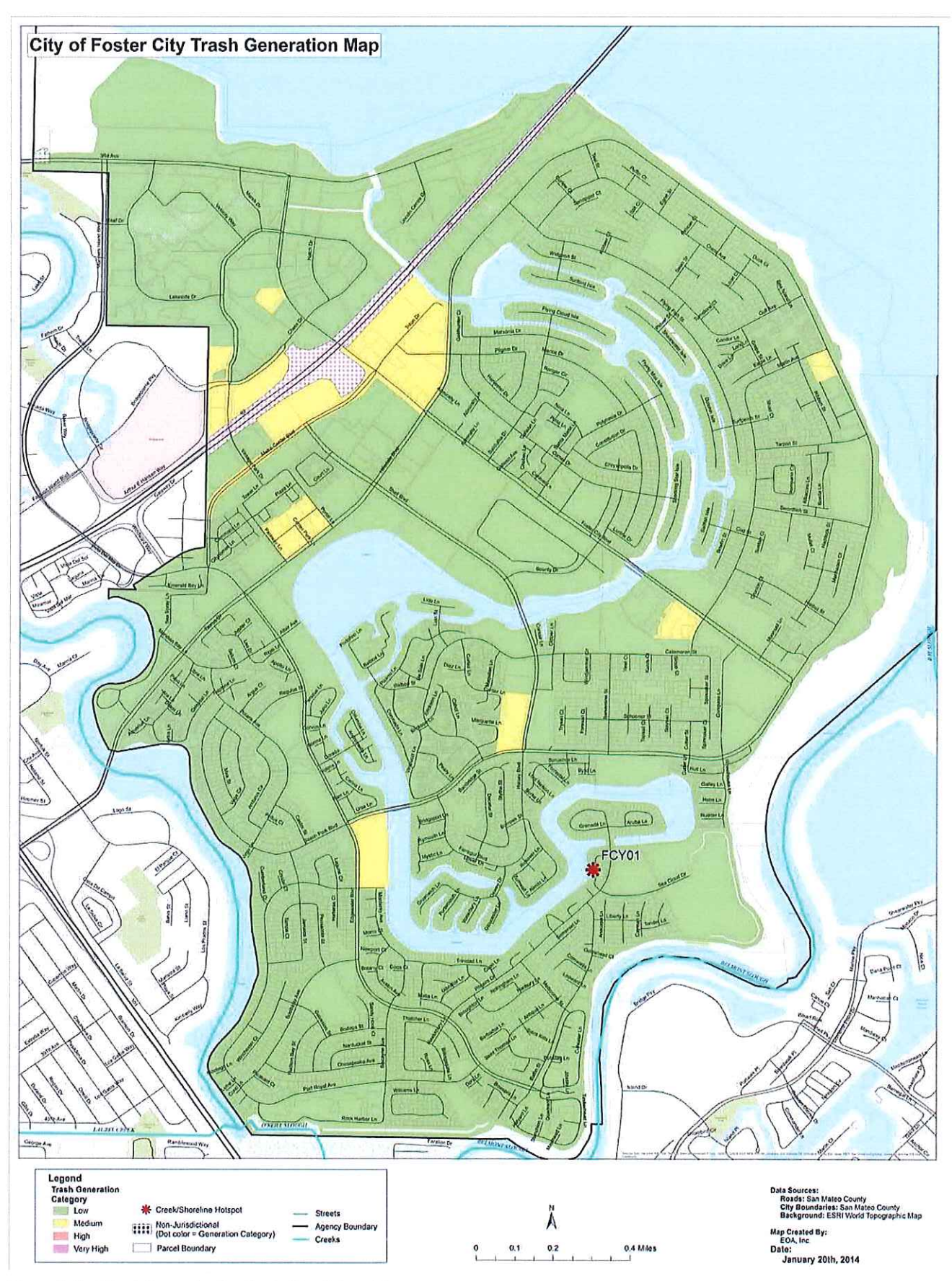
Figure 5. Final Trash Generation Map for the City of Foster City.