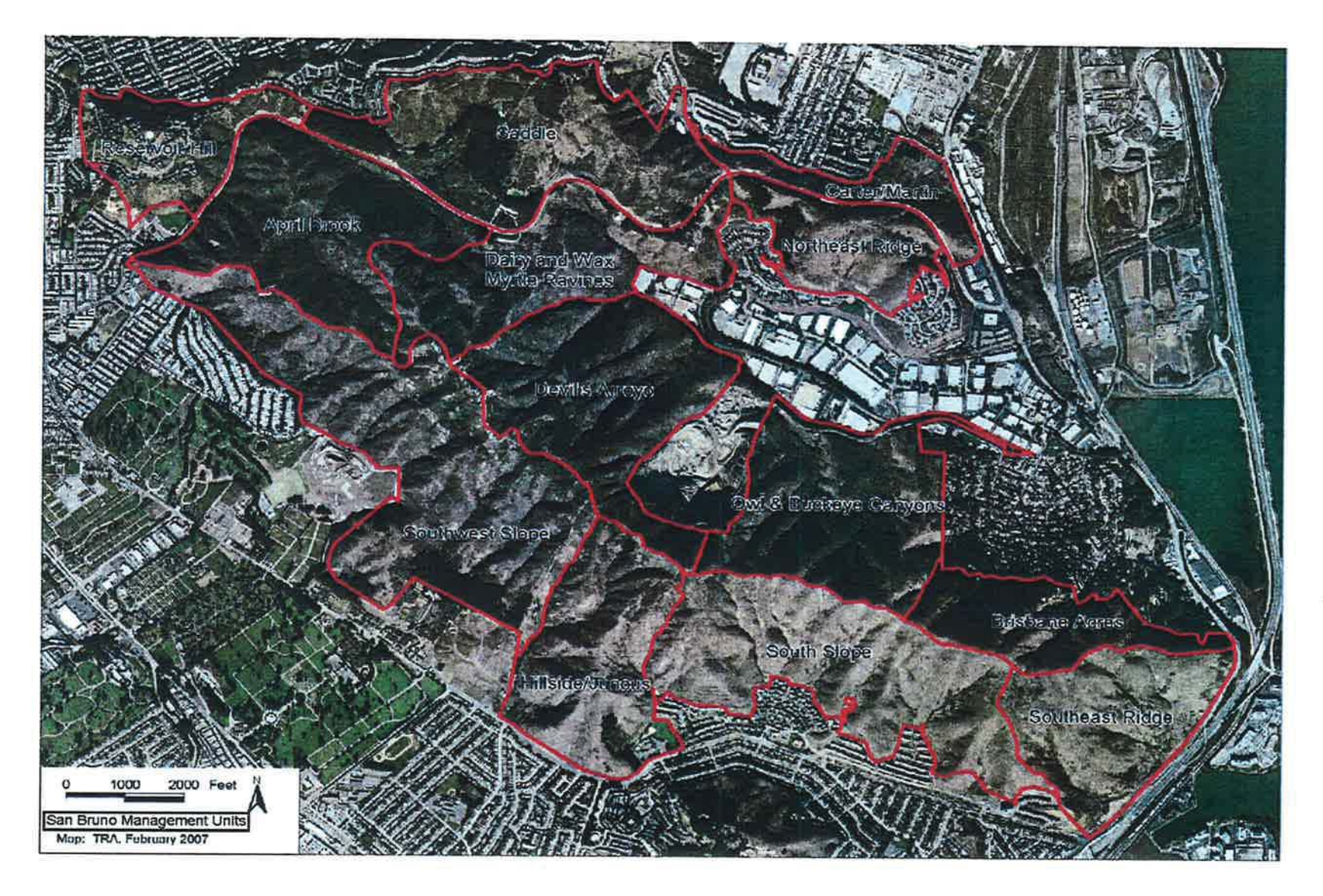
FIGURE 1: San Bruno Mountain Management Units