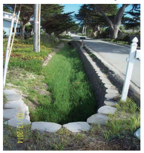
Top left: A vegetated swale on Wienke Way in Moss Beach, before the project. Center: Workers installing vegetated swale. Above: The completed project.

ment features will also be constructed at Fitzgerald Marine Reserve parking lot and along Carlos Street in Moss Beach. Visit <u>http://smchealth.org/asbs</u> for more information and updates on the Fitzgerald ASBS Pollution Reduction Program.