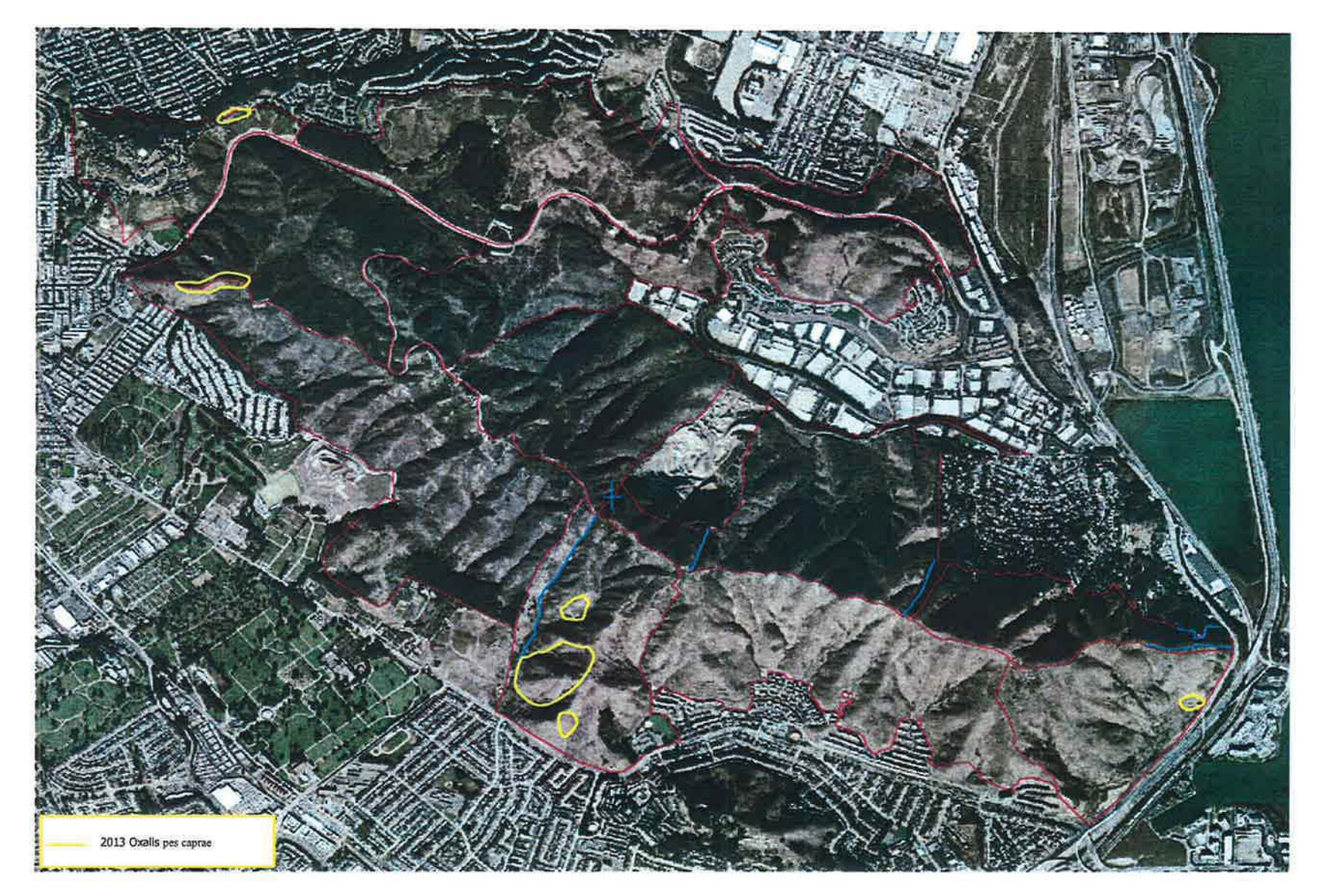
FIGURE 2: 2013 Oxalis pes-caprae Treatment Sites

San Bruno Mtn. HCP Proposed Work Scope for Habitat Restoration and Exotics Control FY 2013 – 2014