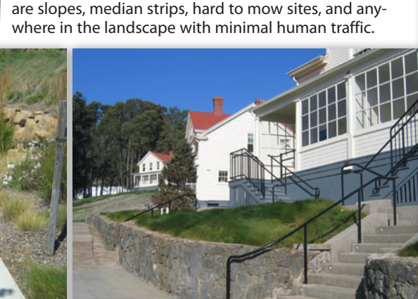
Figure 1. Among the uses for no-mow fineleaf fescues

The most common botanical categorization of fineleaf fescues, all of which are perennial, cool-season grasses, includes four distinct species: creeping red fescue ( Festuca