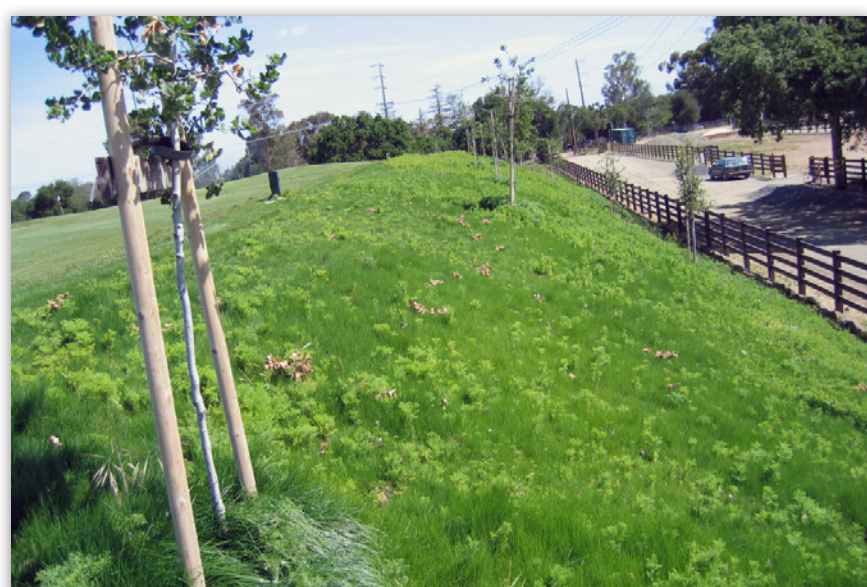
Figure 6. Weed invasion could be a challenge when establishing no-mow fineleaf fescues from seed.

Extremely slow seed germination and seedling growth create challenges for weed control at early stages of turf establishment (fig. 6). In California, many weeds are