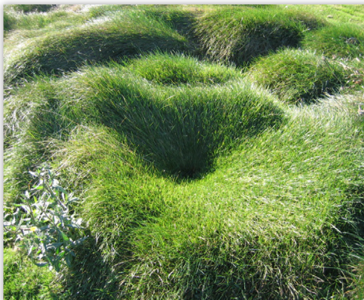
Figure 4. It is necessary to install high-rise irrigation heads for no-mow fineleaf fescue stands. The low-rise pop-up heads do not operate properly when the grass reaches its mature height.

Fineleaf fescues are not recommended for planting on sites where soil stays wet for a long time. They cannot tolerate standing water for more than a couple of consecutive days and are prone to diseases if wet for an extended period.