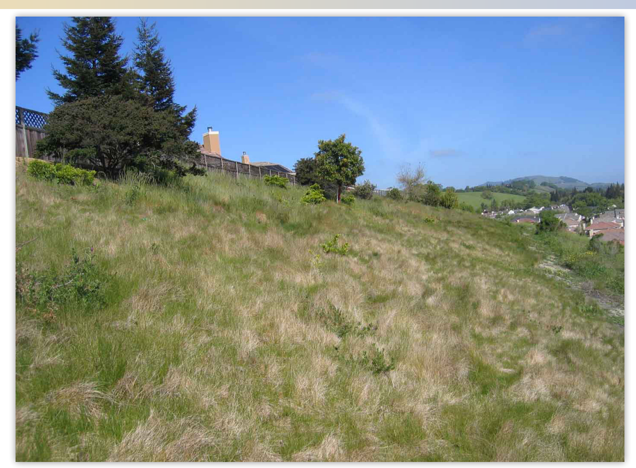
Figure 3. During summer months and under deficit irrigation, no-mow fineleaf fescue stands will go dormant.

points at any location. It is important to emphasize that the 70 percent ET<sub>o</sub> watering requirement specified here is not research based and is offered only as a rough estimate. In regions of California with very hot, dry summers, no-mow fineleaf fescues may require more water to keep the stand green and to prevent dormancy. On the other hand, stands established in shady or foggy areas may need less water than 70 percent ETo.