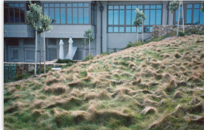
Figure 2. With drooping leaves, no-mow fineleaf fescue stands are natural and attractive.

In 1996, a UC study was undertaken in Santa Clara, California, to address some of the sod producers' concerns (Harivandi et al. 2004). The objectives of the study were to determine whether