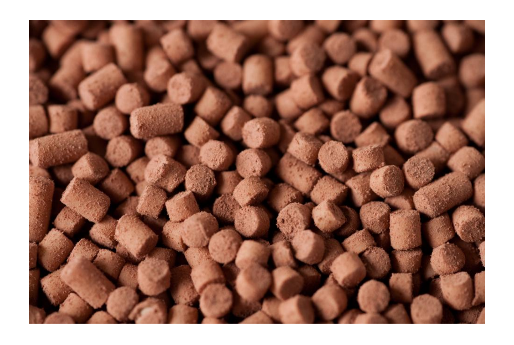
New Coated Pellet is visibly distinct, it is brick-red