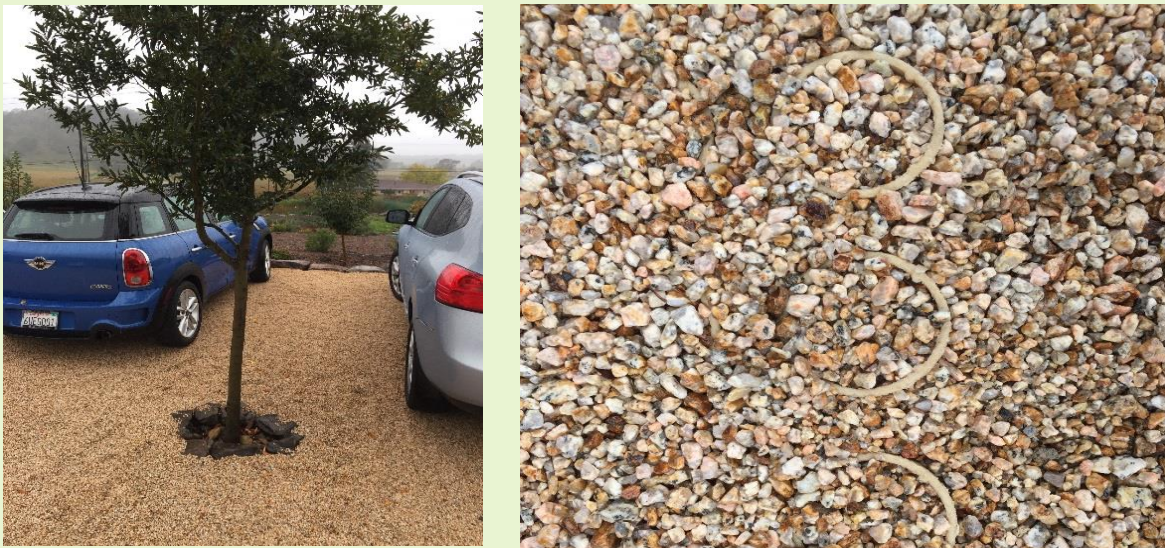
Figure 6-41. Reinforced grid paving in an overflow parking lot in Napa.

Reinforced grid paving consists of concrete or plastic grids used in areas that receive occasional light traffic (i.e., < 7,500 lifetime 18,000-lb equivalent single axle loads or a Caltrans Traffic Index < 5), typically overflow parking or fire access lanes, when placed over compacted Caltrans Class 2 or Class 2 permeable base or similar materials. Class 2 permeable base should use an underdrain in silt and clay soils. The surfaces of these systems can include a layer of gravel as shown in Figure 6-41 below or be planted with topsoil and grass in their openings or installed over a bedding layer that rests over a compacted, dense-graded aggregate base (see Figure 6-42 and Figure 6-43). When planted with turf grass, they also assist in providing a cooler surface than conventional pavement. Some of these systems are also known as turf block or grasscrete. Reinforced grid paving can also be designed with aggregate in the openings.