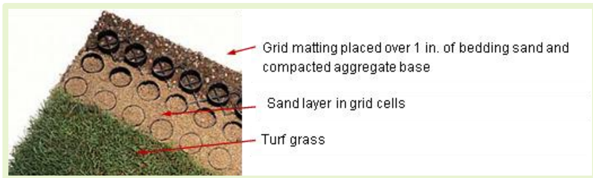
Figure 6-43: Plastic Reinforced Grid Paving for Occasional Vehicular Use or for Emergency Access Lanes (Credit: Santa Clara Valley Urban Runoff Pollution Prevention Program). Note: Sand and turf grass can be replaced with ASTM No. 8 aggregate in cell openings.